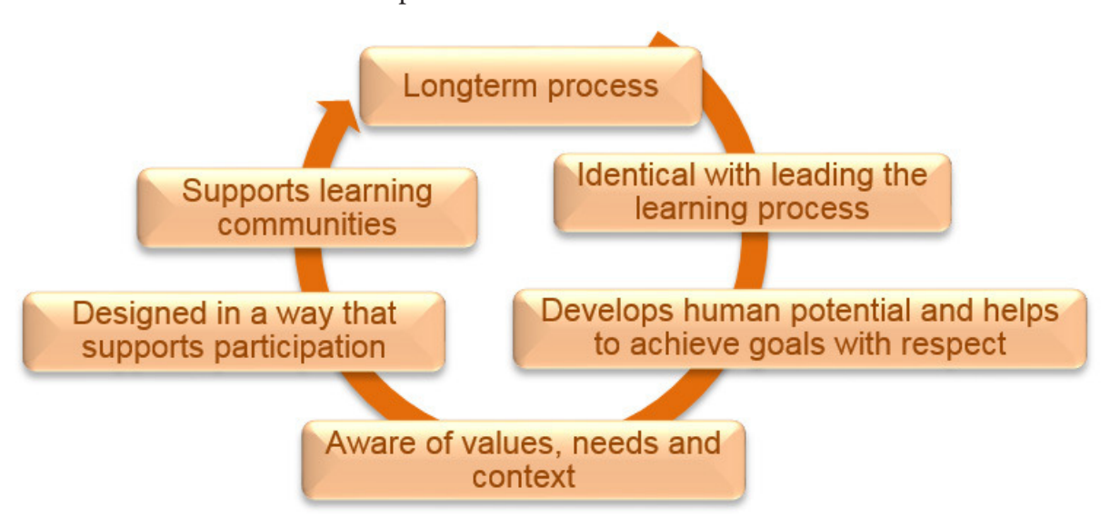
Figure 1. Features of educational leadership